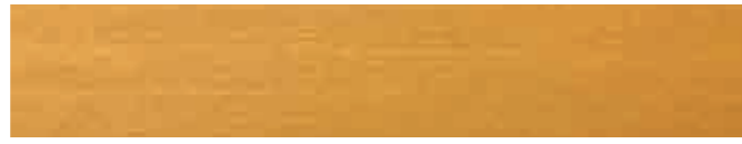
270-012 *kiefer ■ spruce ■ pin pino ■ pino ■ furu