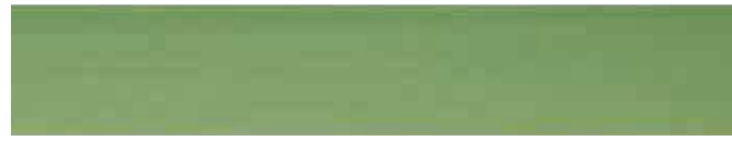
270-113 grün ■ green ■ vert verde ■ verde ■ grønn