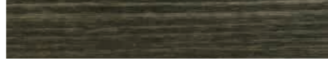
270-102 ebenhholz ■ ebony ■ ébène ebano ■ ebano ■ ibenholt

*Gekennzeichnete Farbtöne nur für den Innenbereich. Die Farbtöne können drucktechnisch bedingt vom Original abweichen. ■ *Marked colors, only for the interior. Due to typographical differences, the color tones can be different from the original. ■ *Teintes utilisables uniquement à l'intérieur. Pour des raisons d'impression, l'exactitude de la reproduction des couleurs ne peut être garantie. ■ *Los colores marcados sólo adecuados para el uso en interiores. Los colores pueden variar con respecto del original, debido a la técnica de impresión.