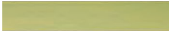
270-116 linde ■ lime ■ tilleul tilo ■ tiglio ■ linde