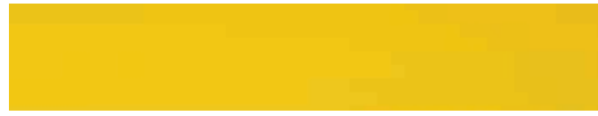
270-413 *zitron ■ lemon ■ citron limón ■ limone ■ sitron