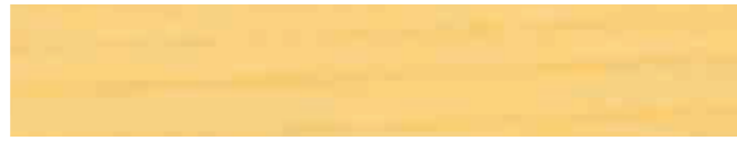
270-002 *farblos ■ colourless ■ incolore incoloro ■ incolore ■ fargelos