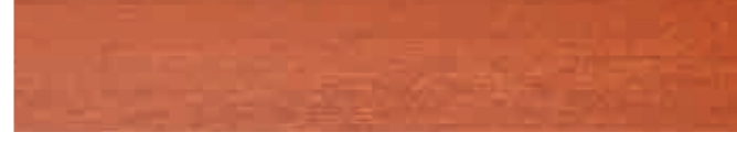
270-416 *blutorange ■ blood orange ■ orange sanguine naranja sanguina ■ rosso sangue ■ bloodappelsin