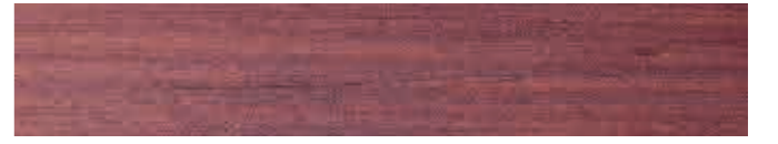
270-134 *flieder ■ lilac ■ lilas lila ■ lillá ■ syrin