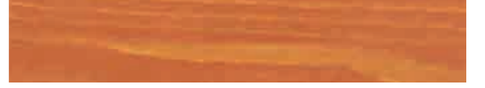
270-056 sanddorn ■ sea buckthorn ■ argousier rojo gayuba ■ olivello spinoso ■ tindvedrod