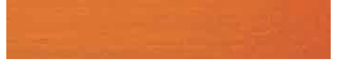
270-415 *orange ■ orange ■ orange naranja ■ arancio ■ appelsin