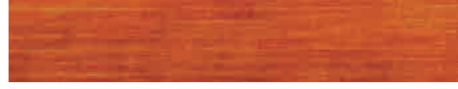
270-052 brasil ■ brazil ■ brésil brasil ■ brasile ■ brasil