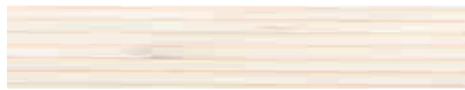
270-202 *weiß ■ white ■ blanc blanco ■ bianco ■ hvit