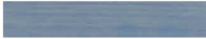
270-124 bauernblau ■ country blue ■ bleu rustique azul campestre ■ blu campagnolo ■ bondeblå