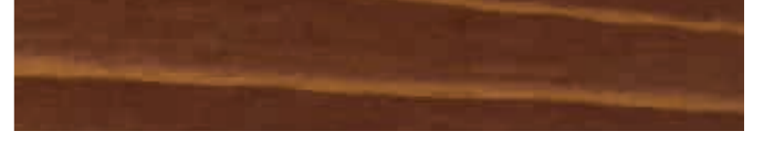
270-082 palisander ■ rosewood ■ palissandre palisandro ■ palissandro ■ palisander